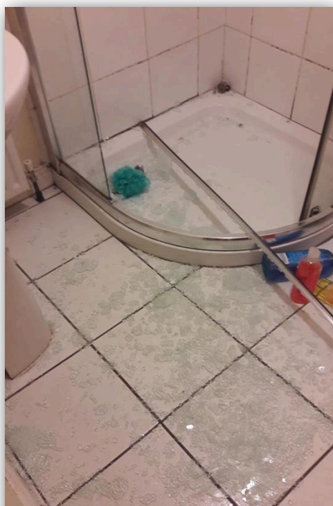
Glass on bathroom floor: unresolved faulty shower door

"they don't seem to care that my children have to walk through the bins at the back entrance every time we come in or go out."