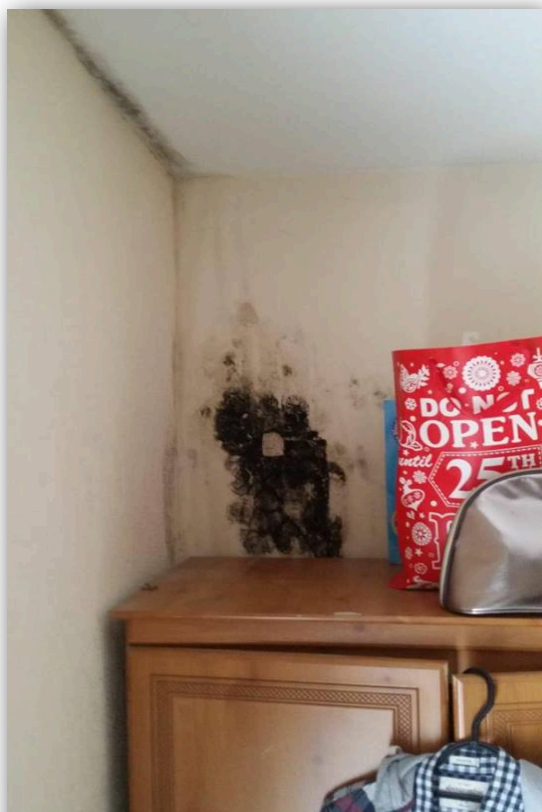
Damp on bedroom wall